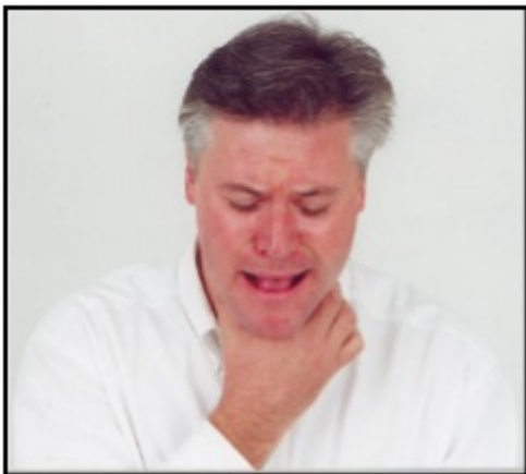
Figure 3: Universal choking sign

In the conscious person who has inhaled a foreign body, there may be extreme anxiety, agitation, gasping sounds, coughing or loss of voice. This may progress to the universal choking sign, namely clutching the neck with the thumb and fingers (as shown in Figure 3).